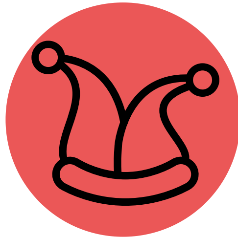
SILLY & JUST FOR FUN